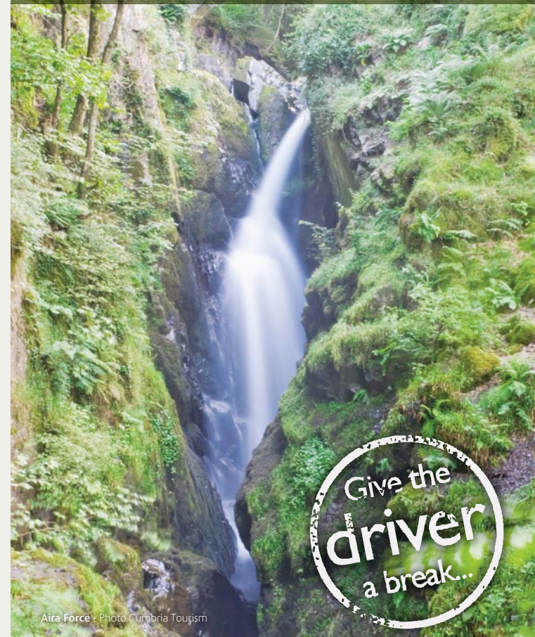
Aira Force - Photo Cumbria Tourism